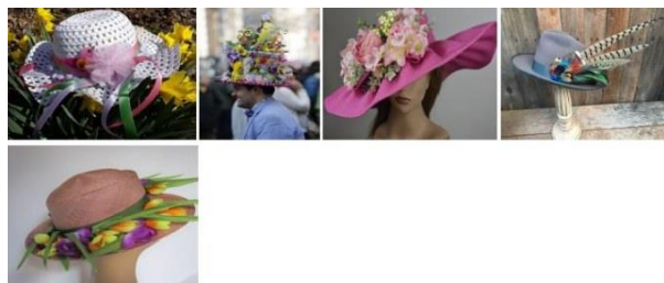
1 - May Day hat inspiration

The May Day parade will aim to leave school at 10.00 am and we will be taking the following route, where you can await our passing: Along Beech Road, turn left along Mill Street, down Thames Street, around the square in front of St Leonard's Church, up Lombard Street (past the Baptist Church), then back down Mill Street and Beech Road back into school. Should the weather be particularly warm, please ensure your child has sun cream on. if it is wet, bring a coat! Social Media/Photographs We understand that you and other family members may want to take video/photographs of your children. Whilst this is absolutely fine, please can we remind you that you must not post these images on to any social media platforms, unless you have consent from ALL parents/carers of the children recognisable in the picture.