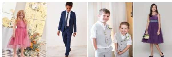
2 - Best dressed ideas